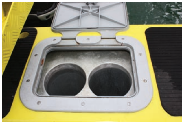
These beautifully made and installed tuna tubes are a worthwhile addition to the large live-bait tank on the other side of the transom.

Each kit generally includes the basic boat shell and building jig, while the fit-out is usually left to the owner. In all cases though, Jim is happy to be consulted throughout the building process, especially about anything that affects the distribution of weight, so he can check that it is positioned in the best place and in the most practical way. This even means those who want advice after hours, as many amateur builders can only work during such times.