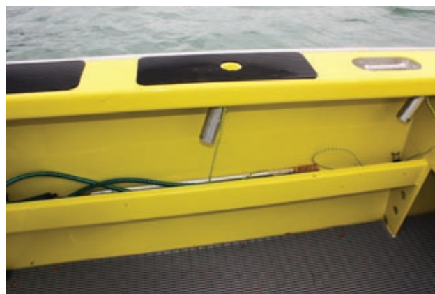
Gaffs, hoses, ropes and other useful items are stored in the generous trays along both cockpit sides.