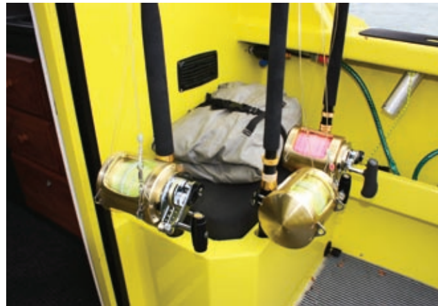
Outdoor seating can also accommodate fishing rods if necessary – and a large bag of trolling lures!