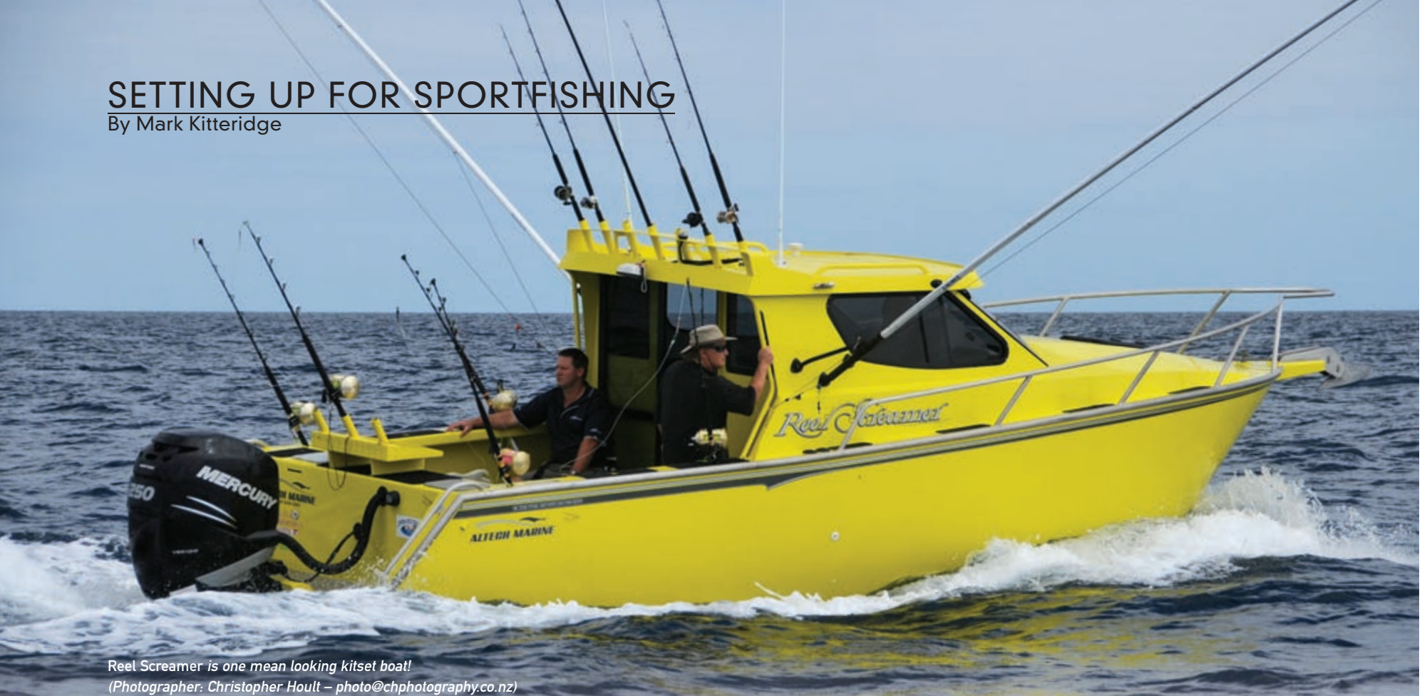
Reel Screamer is one mean looking kitset boat!