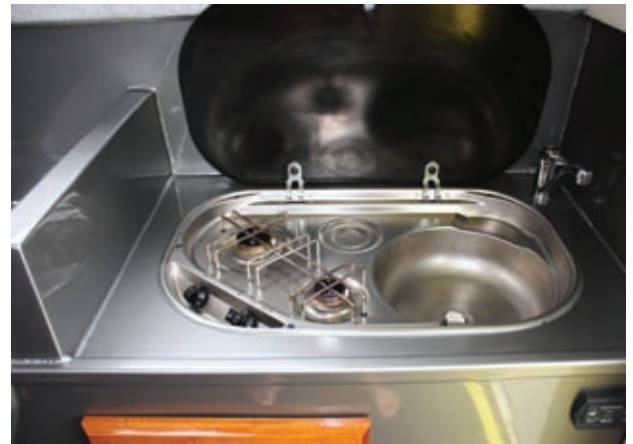
The compact stove-sink unit is very clever.